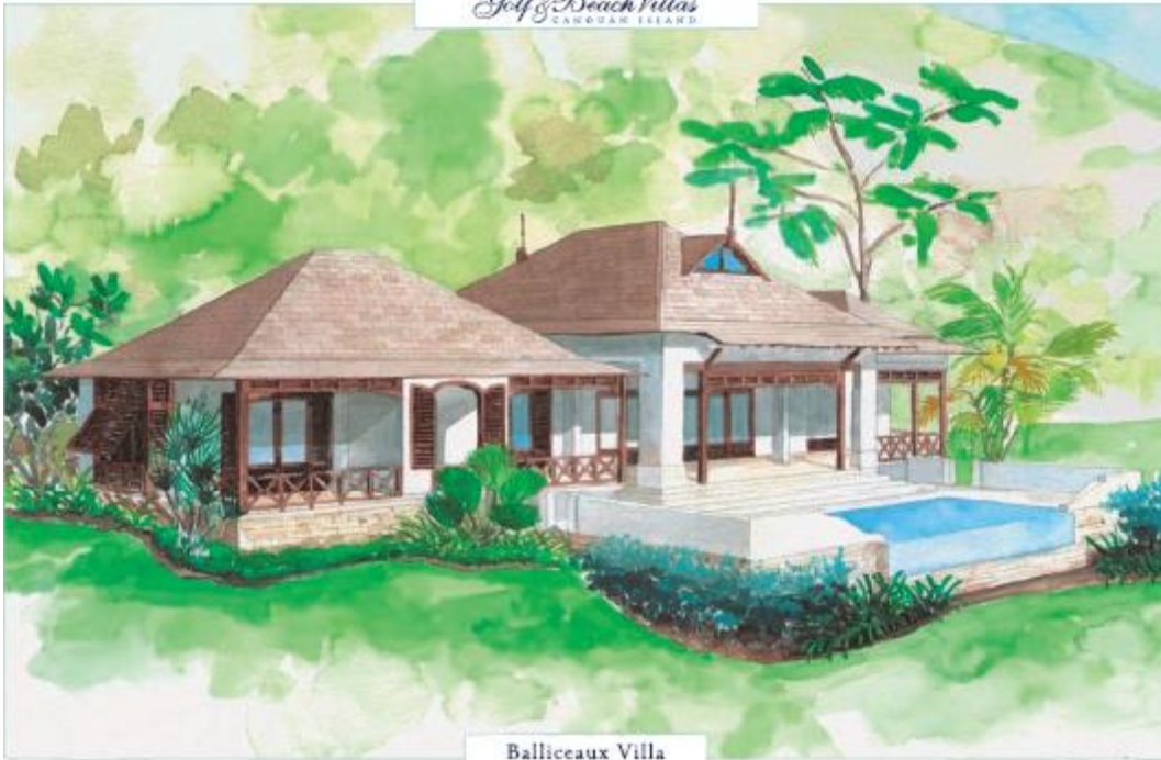
Balliceaux Villa Artist's Impression