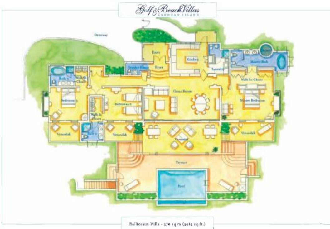
Balliceaux Villa - 370 sq m (3983 sq-ft.)